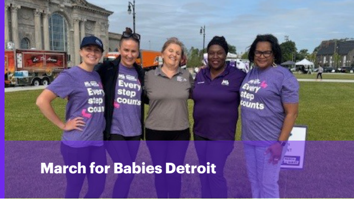
March for Babies Detroit