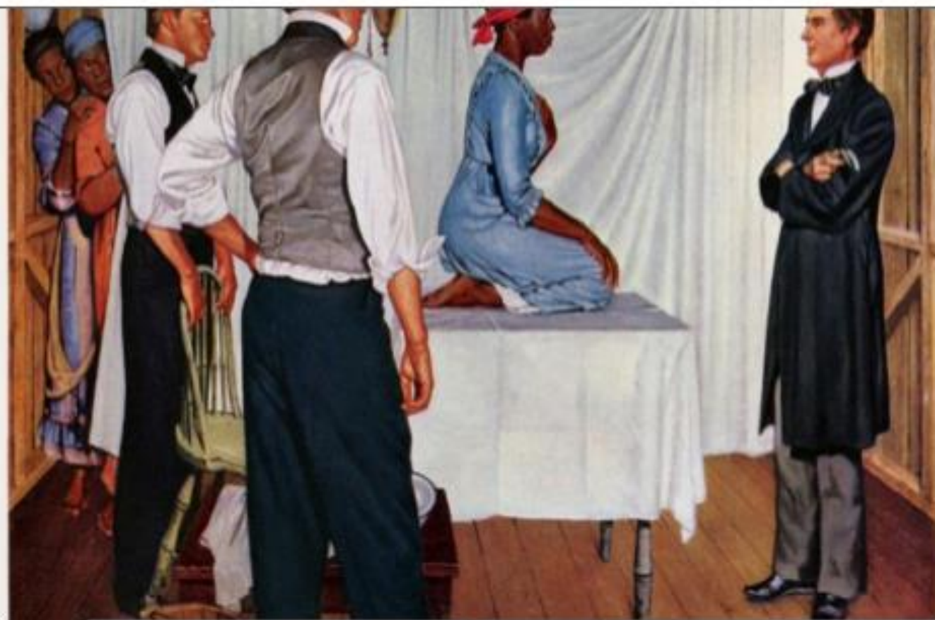
Illustration of Dr. J. Marion Sims with Anarcha by Robert Thom. Anarcha was subjected to 30 experimental surgeries. Pearson Museum, Southern Illinois University School of Medicine

SOURCE: PEARSON MUSEUM, SOUTHERN ILLINOIS UNIVERSITY SCHOOL OF MEDICINE